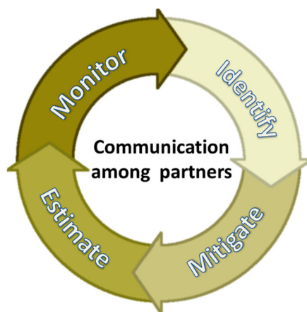
Figure 2. PIXEL Risk Management procedure

Moreover, communication happens throughout all the activities of the risk management. Through the communication, project partners provide information and feedback, both internal and external to the project, relating to the risk activities, as well as identification and mitigation of current and emerging risks.